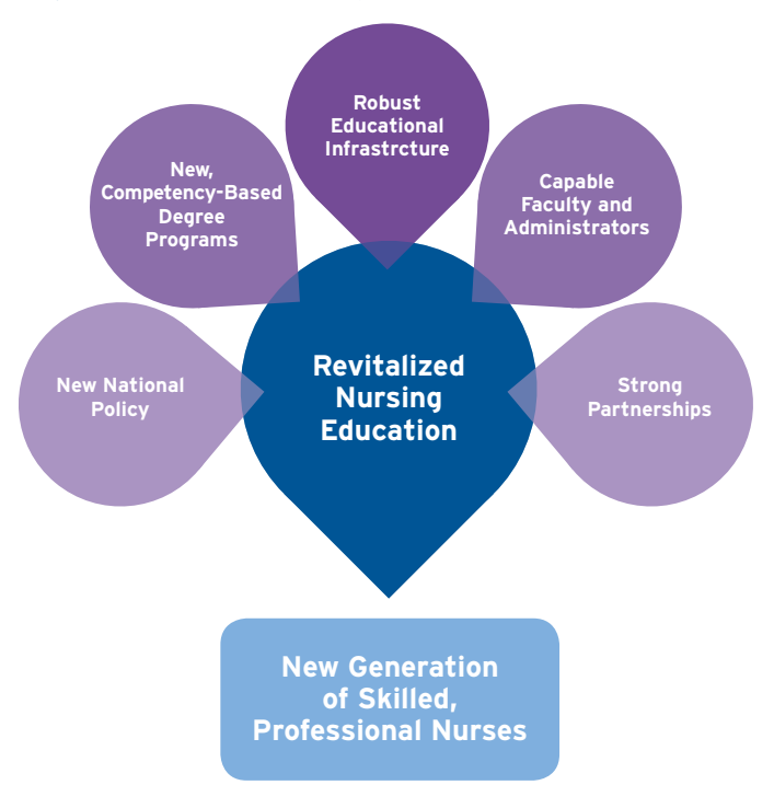
Figure 1: Core NEPI Components

he new generation of graduating nurses will be able to hit the ground running, entering clinical practice with the skills needed to treat patients in today's South Africa.