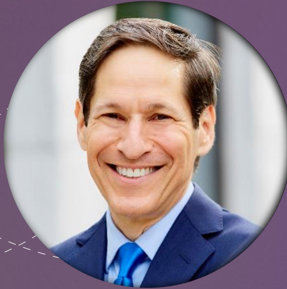
Thomas R. Frieden, MD, MPH President & CEO, Resolve to Save Lives